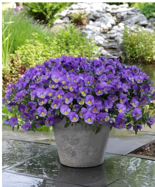
Amazing Colour with Cool Wave Blue Skies

Here are 2 great ideas to help you maximise the