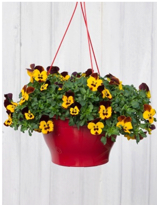
Cool Wave Red Wing 3 plugs in a hanging pot