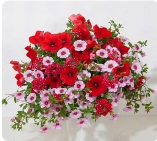
NEW Trixi Coco Bello

For further information on any of the varieties please contact our Customer Services team or your local Technical Sales Representative.