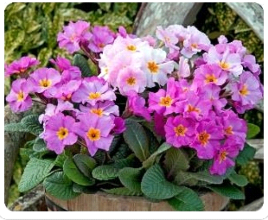
Polyanthus F1 Stella Pink Champagne