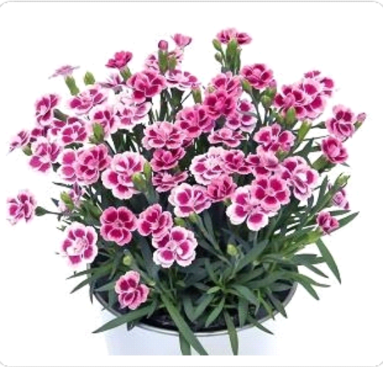
Dianthus Pink Kisses®