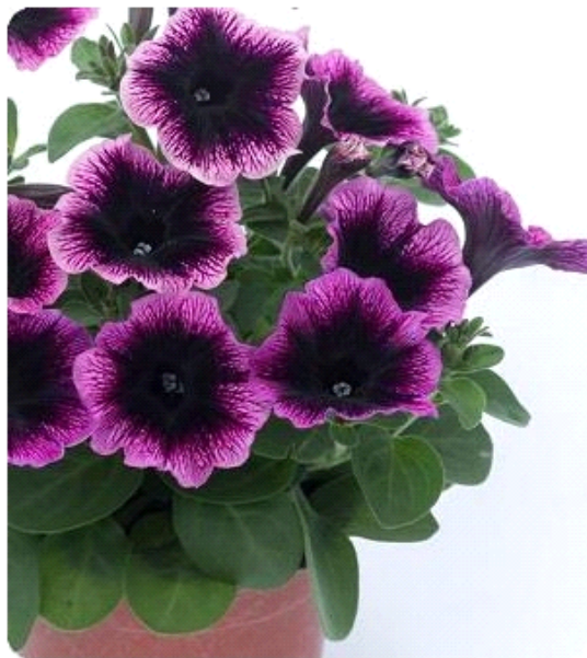
Ovation Dark Heart - 13cm pot

Bred in the UK, Ovation has been specifically developed to provide Growers with an effortless Pot Petunia for premium colour sales in 13cm pots or larger. In the Garden Centre, these plants are packed with high colour appeal and give an outstanding shelf presentation. In the garden, Ovation delivers a performance to die for with its neat, mound-forming habit in patio containers all Summer