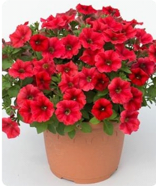
Ovation Fireglow - Patio container